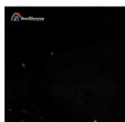
Without white light