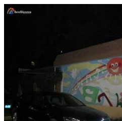
With white light